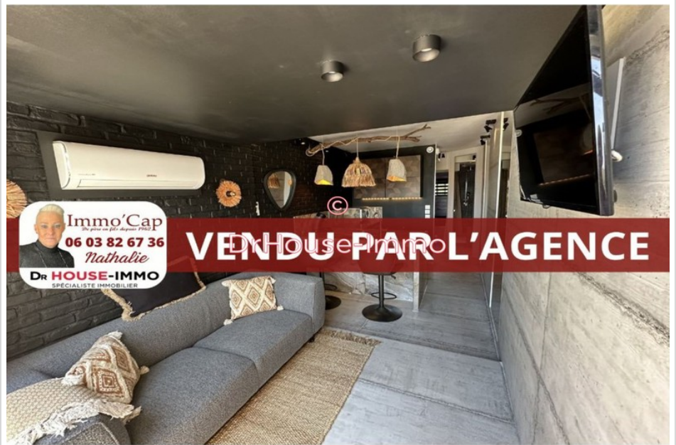
Apartment 76268 cap d age