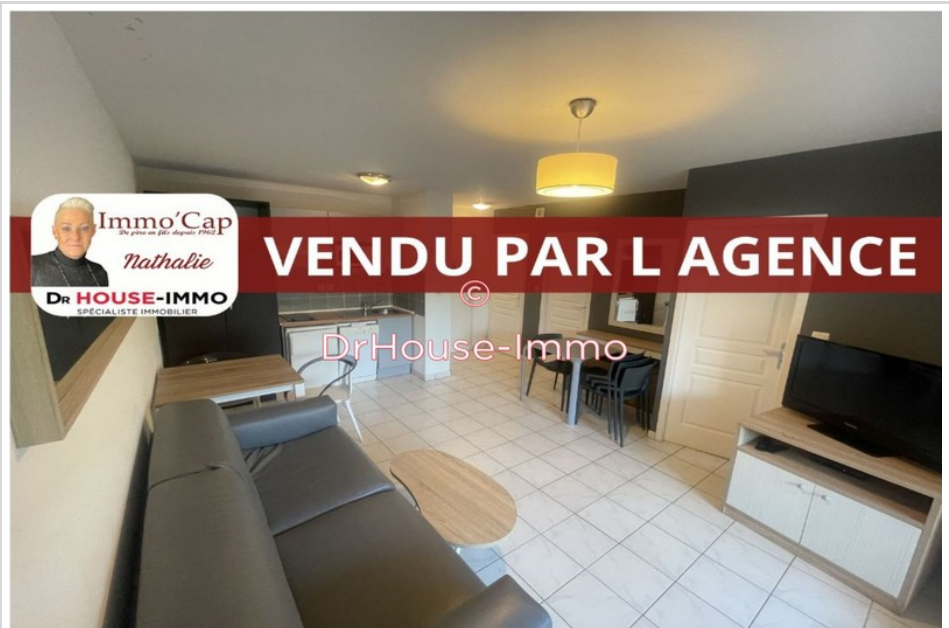
Apartment 69592 cap d age